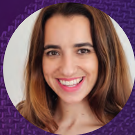
SOPRANO THEODORA COTTARELL