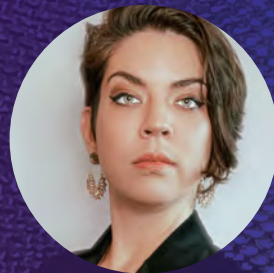
MEZZO-SOPRANO ZARA ZEMMELS