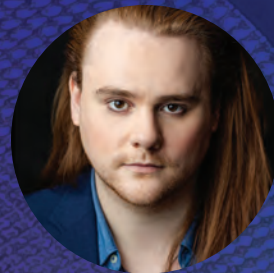
TENOR RIVER GUARD