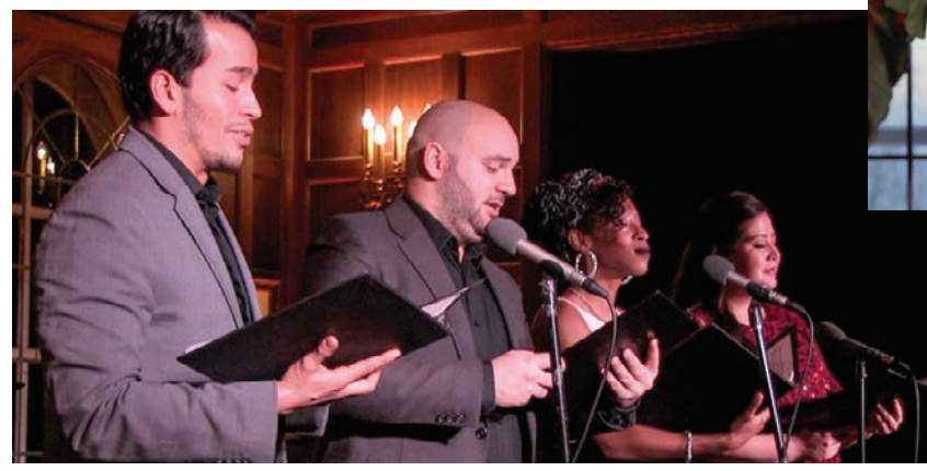
FLORENTINE PRESENTS AND BLACK-TIE OPTIONAL MADE POSSIBLE BY